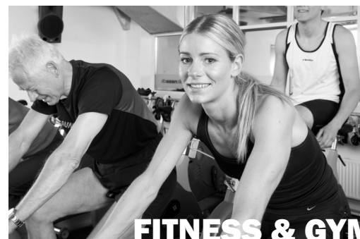
FITNESS & GYM